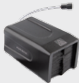
11-0138 Heated Holder, 36 V 11-0139 Heated Holder, 24 V 11-0140 Heated Holder, 48 V