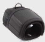
11-0109 PowerHood Padded Cover